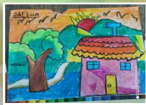
Hritvi Gogri (I-B)